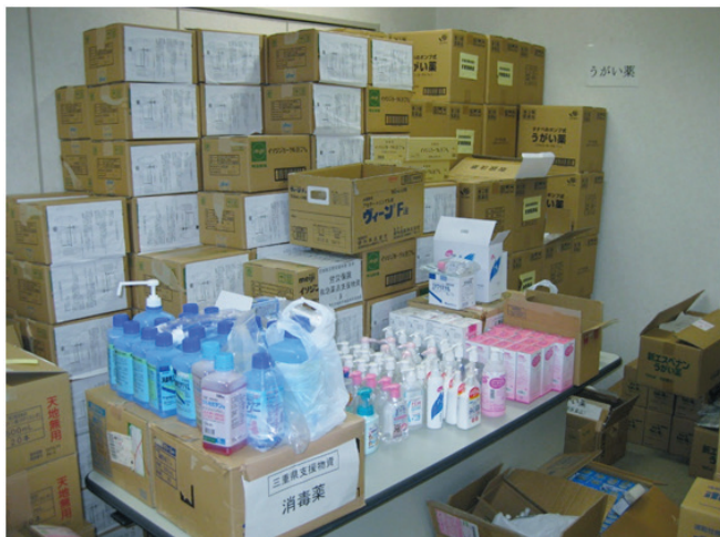
Photo: Piled-up relief materials after the Great East Japan Earthquake. taken on April 20, 2011, location: Miyagi Prefectural Pharmacists Association Hall (Sendai City, Miyagi Prefecture). The photo shows piles of hand sanitizers from other areas. The amount of supportive and hygienic medicines and hygiene products was enormous and pharmacists on site were sorting them according to their needs.

Hand sanitizer was very useful to disinfect and cleanse hands directly under the guidance of pharmacists in evacuation sites. It would be valuable during the COVID-19 pandemic for pharmacists to proactively intervene in the improvement of the living environment where infections are likely to occur.