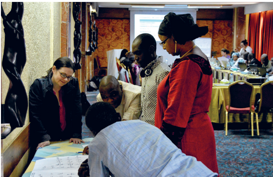
Photo: Project implementers and members of the Mali Technical Task Team at an NEP workshop (from the NEP collection, used with permission)

cilitated access to data and areas of expertise outside those of IIP-JHU, further enriching NEP as a national M&E platform. Despite these successes, consistency in participation throughout the learning cycles varied across the four countries, in some cases limiting the effectiveness of capacity building efforts. Planning activities more in advance and with greater frequency, eg, through working sessions between formal workshops, helped increase TTT member participation, especially when the sessions were coordinated autonomously by local NEP team members.