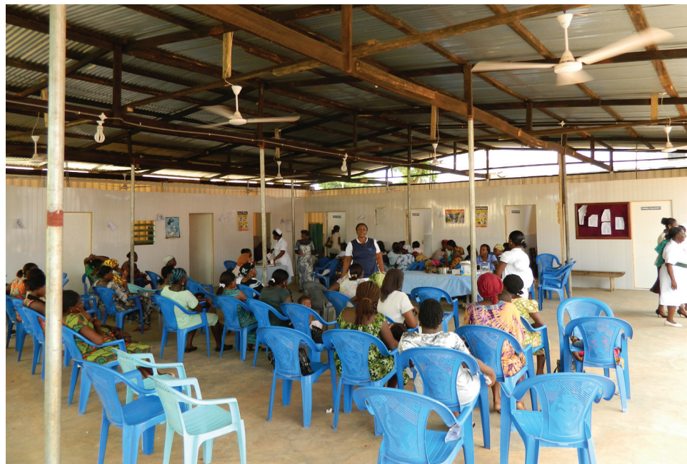
Photo: Meeting with a group of stakeholders at the maternity health clinic in Ghana (Courtesy of Dr Alice Graham, personal collection)

It is also important to note that in all exercises that applied the “weights”, this procedure didn't really have dramatic effects on the final rankings of the research ideas. Although a research idea might move a few places up or down the list following the weighting procedure, these shifts did not profoundly affect the non-weighted ranking order that was determined by the researchers and experts. Perhaps this is one of the additional reasons why so many groups conduct-